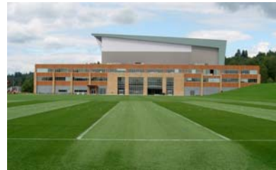
The new facility features offices, training and practice facilities.

The new practice facility for the Seattle Seahawks, the Virginia Mason Athletic Center (VMAC), just opened on the shore of Lake Washington in Renton, Washington. We keep getting asked the same question: “Who is Virginia Mason, and why is the building named after her?” Actually, the building is named after the Virginia Mason Medical Center, a long-time partner of the Seahawks. The facility incorporates a regional flair including gracious overhangs, natural lighting, use of regional materials such as quarried stone, and a local landscape design strategy that restores the Lake Washington shoreline to its native habitat. By the way, Virginia Mason Medical Center is named after the daughters of two of the founders of the hospital. Click here for more pictures.